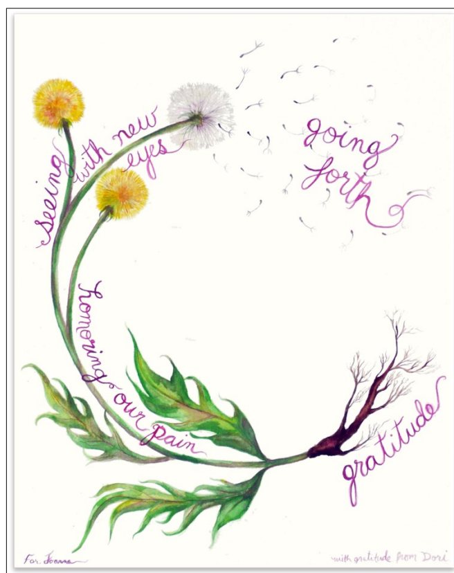
Figure 3 - The Spiral of the WTR (by Dori Midnight)