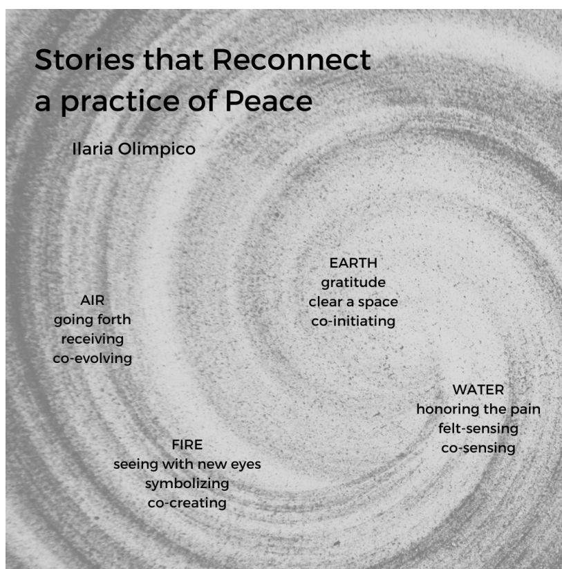
Figure 1 - Stories that Reconnect (map by Ilaria Olimpico)

It begins with a connection to the Earth, with gratitude, and with an act of making space. Then there is a transition to Water, where there is the invitation to honor our pain for the world and our wounds, engaging in felt sensing and co-sensing. Then, with courage, there is a Fire threshold, where, symbolizing and co-creating, it is possible to see with new eyes. Finally there is Air, going forth, welcoming and co-evolving.